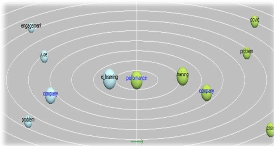
Figure N°2: The relationship between performance and company.