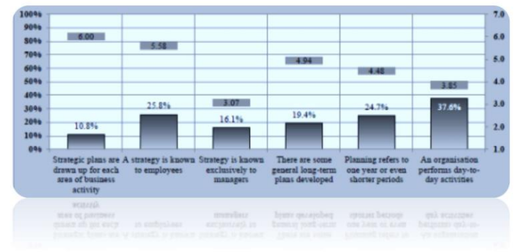
Figure 1: Strategic Awareness in Moroccan SMEs

The first-factor analyzed-strategic awareness-indicated whether strategic plans were formulated and whether employees were kept informed of these plans in the companies examined (fig.1).