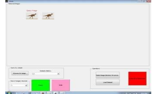
Figure (e):Snapshot after loading dataset

Journal of Advance Research in Computer science and Engineering (ISSN: 2456-3552)