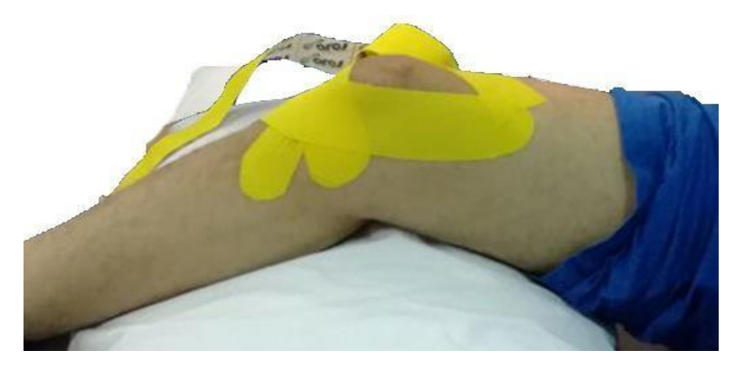
Fig. 1: Showing a male participant during received Kinesio tape (KT).

Standard deviation and mean for the obtained data were calculated. Also, the data obtained were analyzed by SPSS 13.0 software test to compare the data before and after treatment within groups. The significant threshold set at p < 0.05, or non-significant set at p > 0.05.