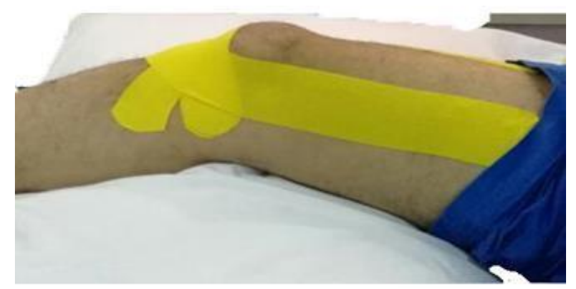
Fig. 2: Showing a male participant after received Kinesio tape (KT).