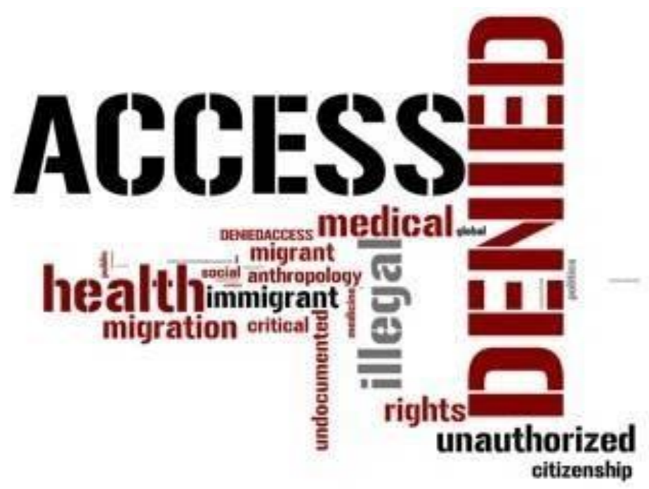
Neuroanthropology-Access Denied – Neuroanthropology

We are currently tried to focused on the health sector and directed at organizational and / or system level determinants of access ( supply-side). The access framework was useful in uncovering the disparity between supply- and demand –side dimensions and pinpointing areas which could benefit from further attention to close the equate gap for vulnerable populations in accessing PHC services that correspond to their needs.