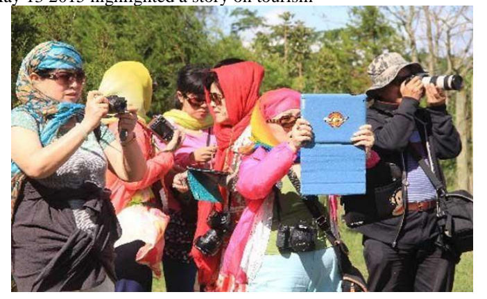
Extract 5 The Standard Tuesday May 13 2015 highlighted a story on tourism

The Standard Friday June 8 2018 "Businesses cite biggest barriers in Africa" by Li Lianxing begins the first paragraph by saying "Chinese investors and potential investors have long regarded a good China-African relationship as a solid basis on which they can build success. But often when the uninitiated finally step onto the African soil they realize how simplistic the term "China-Africa relationship" really is. It goes on to report that "Fifty-three percent of the 75 Chinese companies sounded out in the survey said corruption is "a very significant obstacle" to doing business in Kenya, and 15 percent said it is "a significant obstacle". Sixty-three percent of respondents said crime, theft, disorder and personal safety were significant or very significant obstacles.